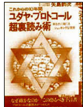
Protocols of the Elders 1987 Japanese edition

the Japanese views of the Protocols . He notes that this year is the 100th anniver- sary of the publication of The Protocols of the Elders of Zion .