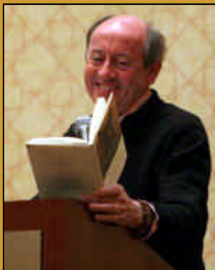
An evening with Poet Laureate Billy Collins.