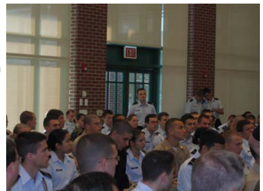
Full House for Maj Gen Newton's Lecture